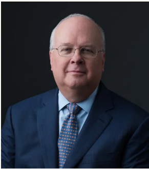
The Honorable Karl Rove SENIOR ADVISOR AND DEPUTY CHIEF OF STAFF, PRES. GEORGE W. BUSH

Session: 2024: David Axelrod and Karl Rove on the most important election ever