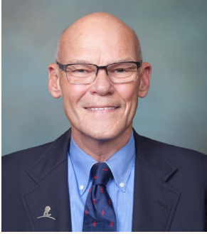
James Carville POLITICAL STRATEGIST AND AUTHOR

Session: Bari Weiss' Honestly podcast recording: The Future of the Democratic Party