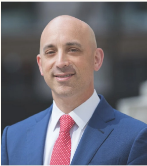
Jonathan Greenblatt CEO AND NATIONAL DIRECTOR, ANTI-DEFAMATION LEAGUE

Session: Fighting the Fringe: How to combat extremism in all its forms