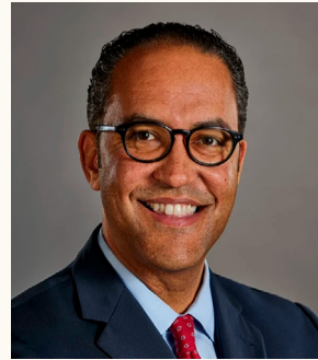
Will Hurd REPUBLICAN CANDIDATE FOR PRESIDENT; FORMER U.S. REPRESENTATIVE (R-TX)

Where: St. David's Episcopal Church, Sanctuary